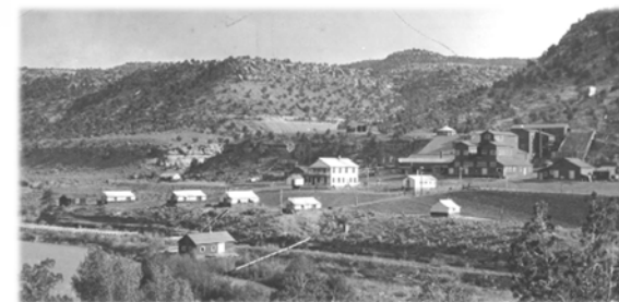
Uravan showing Boarding House, Joe Jr. Mill. C. 1915