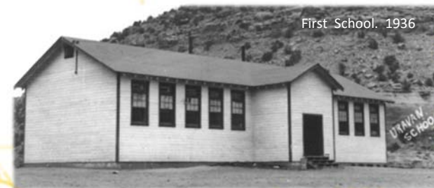
First School. 1936