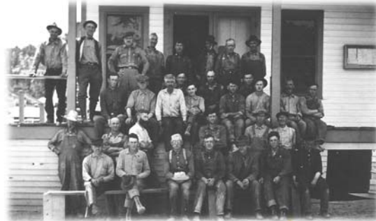
Joe Jr. Mill crew. C. 1920

1928: U.S. Vanadium Corp. (USV) acquires the plant and operates 900 local mines. 240 tons of ore processed each day for vanadium, used in hardening steel. 4,000 workers in the total operations.