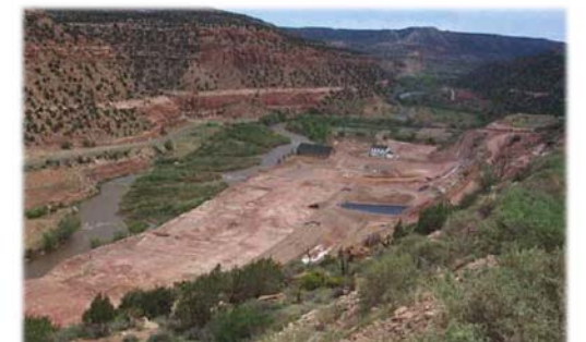
Uravan 2000, Boarding House upper right.