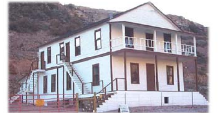
Boarding House, 2000. Umetco Photo Files