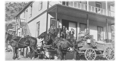
Boarding House. C. 1914

The RIMROCKER HISTORICAL SOCIETY was on a mission. For the past 10 years they had watched helplessly as this historic town had been declared a Super Fund Reclamation Site; as it was being plowed up, shredded, and buried; and now they had a chance to salvage two structures. They lobbied successfully to have these landmark buildings preserved and added to the State Register of Historic Places , winning the Stephen Hart Award for their work. Why the turn of events?