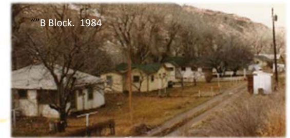
"B Block. 1984