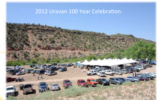
2012 Uravan 100 Year Celebration.

Early 2000s: DOW Chemical acquires Umetco.