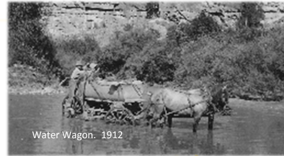
Water Wagon. 1912